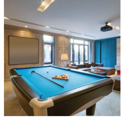
CLUB HOUSE & INDOOR GAMES