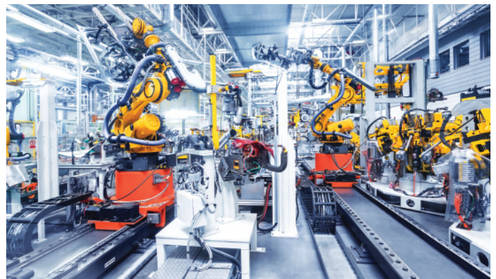
Automobile & Auto Ancillary