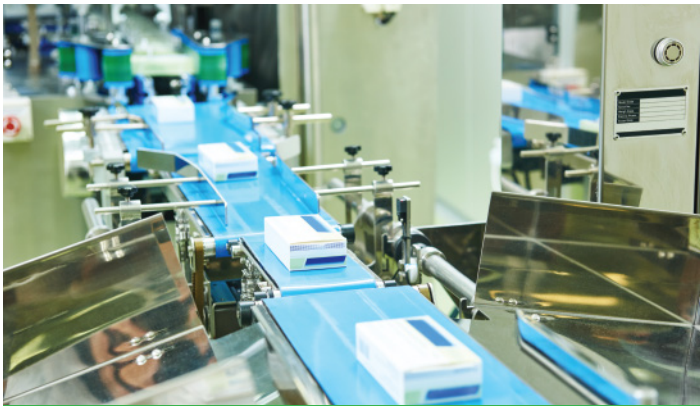
Pharma & Bio-Tech