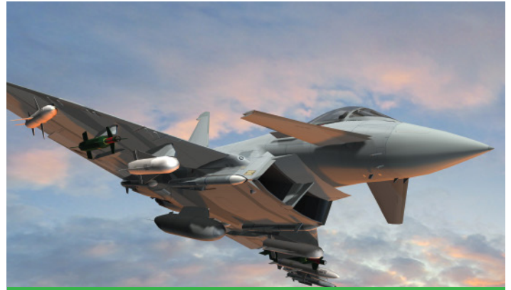
Aviation & Defense