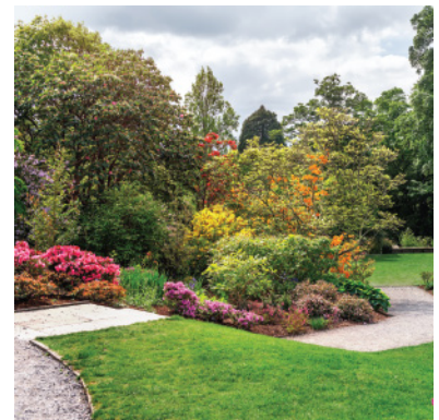
EXQUISITE LANDSCAPE GARDEN