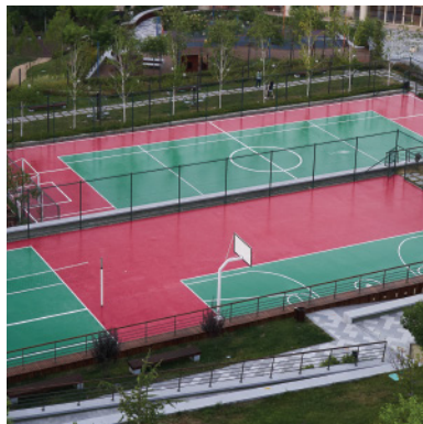
BASKETBALL & VOLLEYBALL COURT